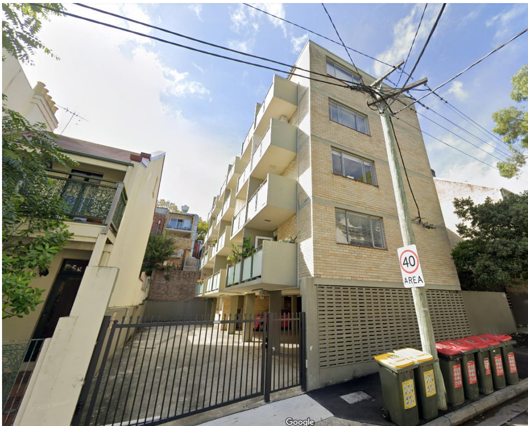
Figure 3. 100-104 Brougham Street looking east from Brougham Street